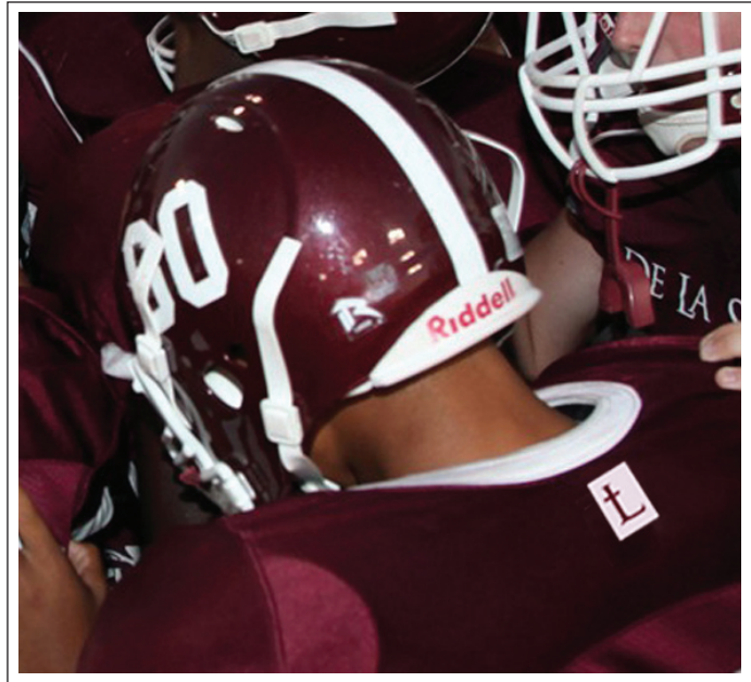
Picture mark reversed out of white on a football jersey.