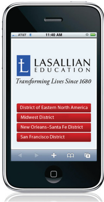
Logo and unifying statement.

The Crossed L , picture mark, signature and unifying statement are designed for multiple applications. As the brand platform and identity become widely embraced and executed, it is possible to use only the picture mark like the Nike Swoosh .